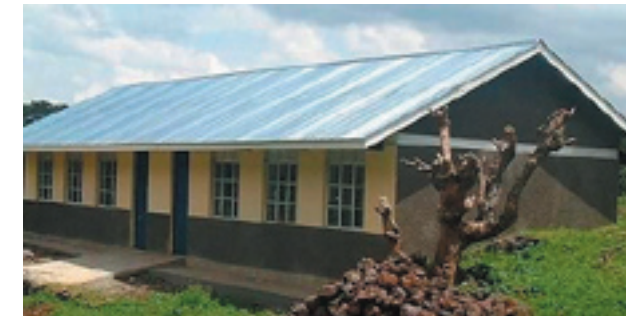
New classroom block completed in 2007