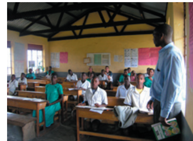
Interior of new classroom